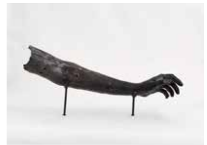
Said Baalbaki The arm, 2011