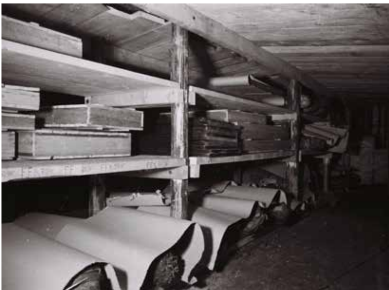
Storage at the Altaussee salt mine, 1943/44