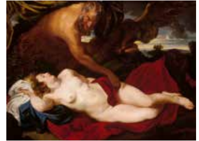
Antonius van Dyck, Jupiter as Satyr at Antiope, c. 1620